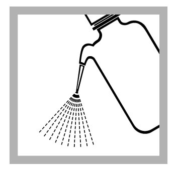
1. Rinse the probe with deionized water. Dry the probe with a lint-free cloth.